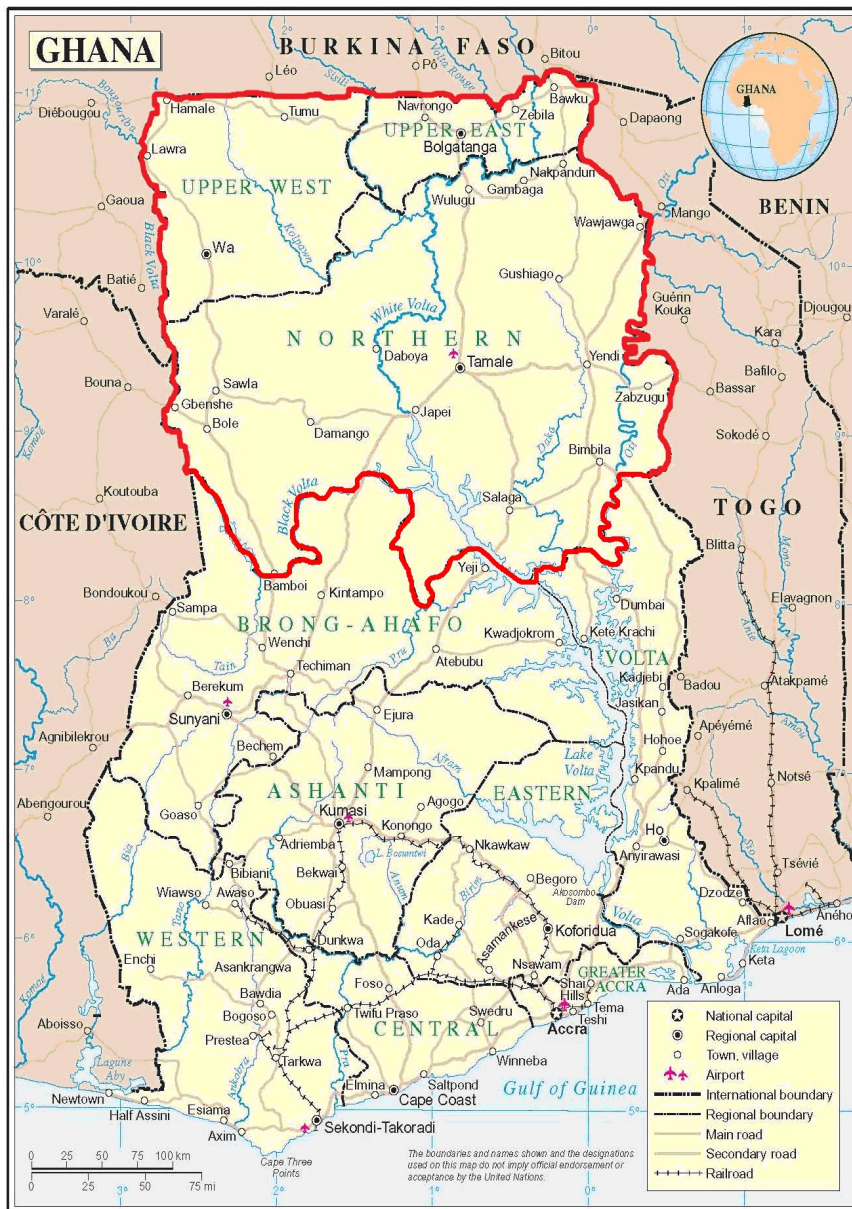
Figure 1: Map of Ghana showing affected areas.